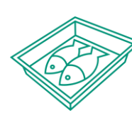
Food trays and skin pads